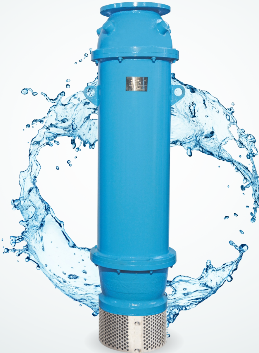
Polder Submersible Pump